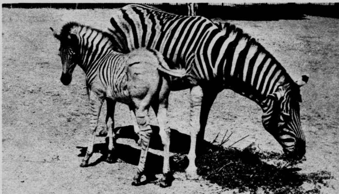
UNHAPPY HANSI. Hansi, a baby zebra born at the zoo in Austria, seems worried about his lack of black stripes on his hindquarters. Zoo officials consider his missing colors a rare exception and so does poor Hansi who asked: "Why do my stripes stop at the most important place?"

Slice yourself some Essex Cervelat ; Plump, Firm, Delicious!