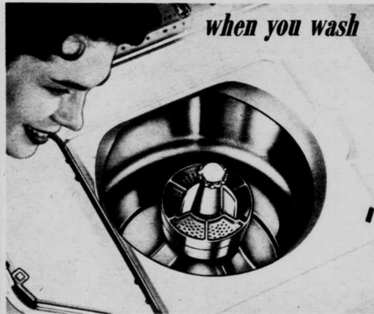
when you wash