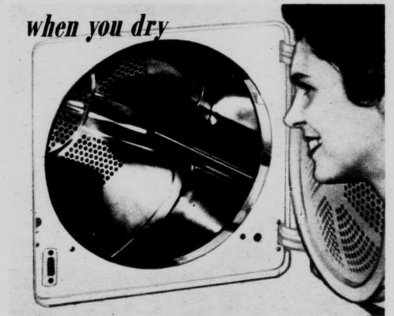
when you dry