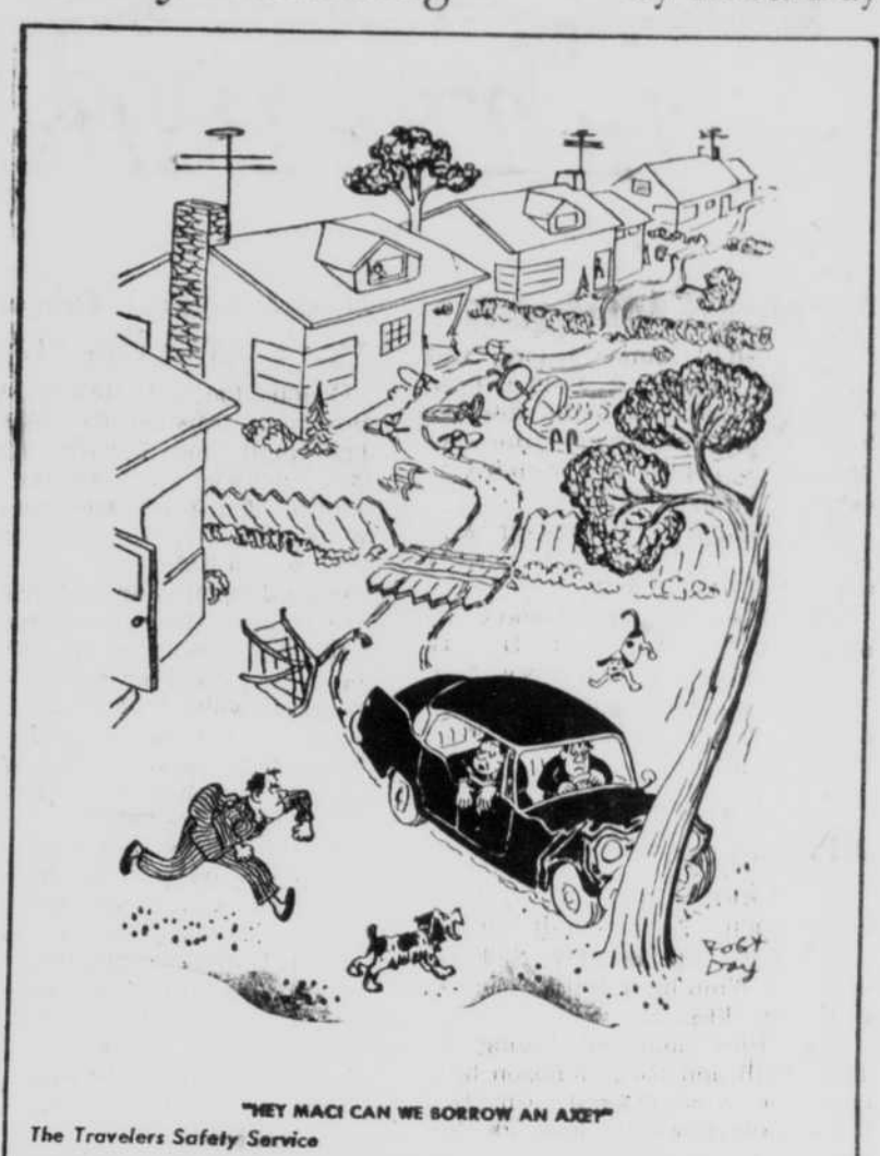
More than 3,000,000 persons were killed or injured in motor vehicle accidents in 1960.