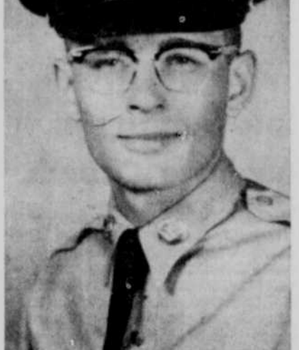
All of the Wing Staff positions were appointed to their positions on the basis of performance during their junior year in ROTC and upon their performance during a four week summer training period which was completed this summer at Air Force bases throughout the United States.