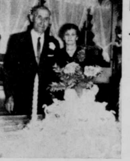
and organist for the past 35 years sang "Ave Maria."