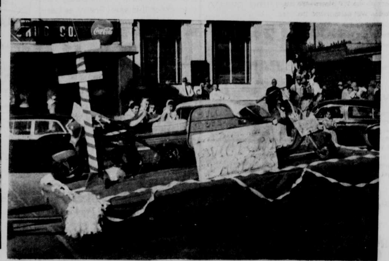
This float depicting the pitiful condition of the Bulldogs was prepared by the sophomore class.