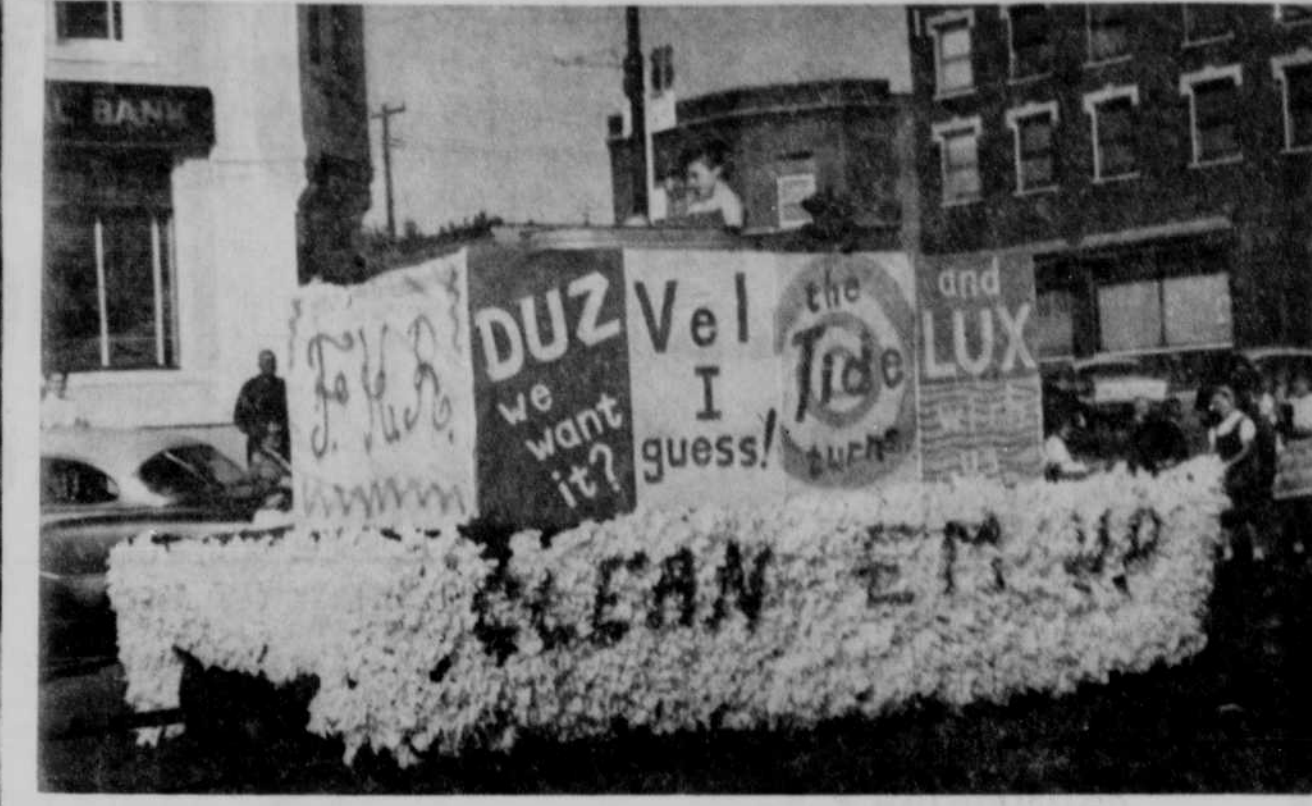
The Future Homemakers were going to give Creighton a good cleaning.