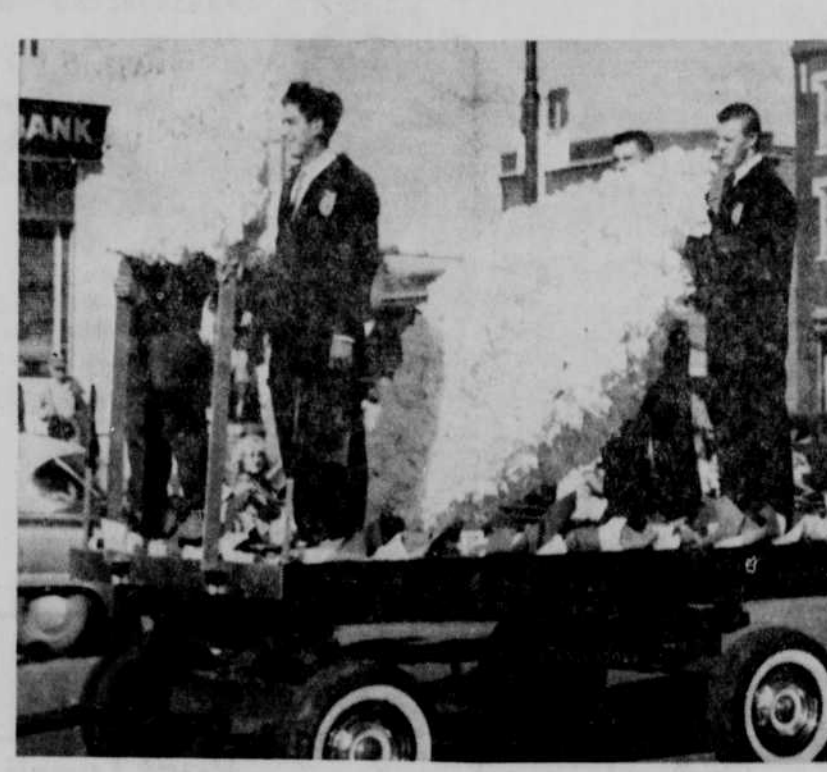
The Future Farmers float was all set to score.