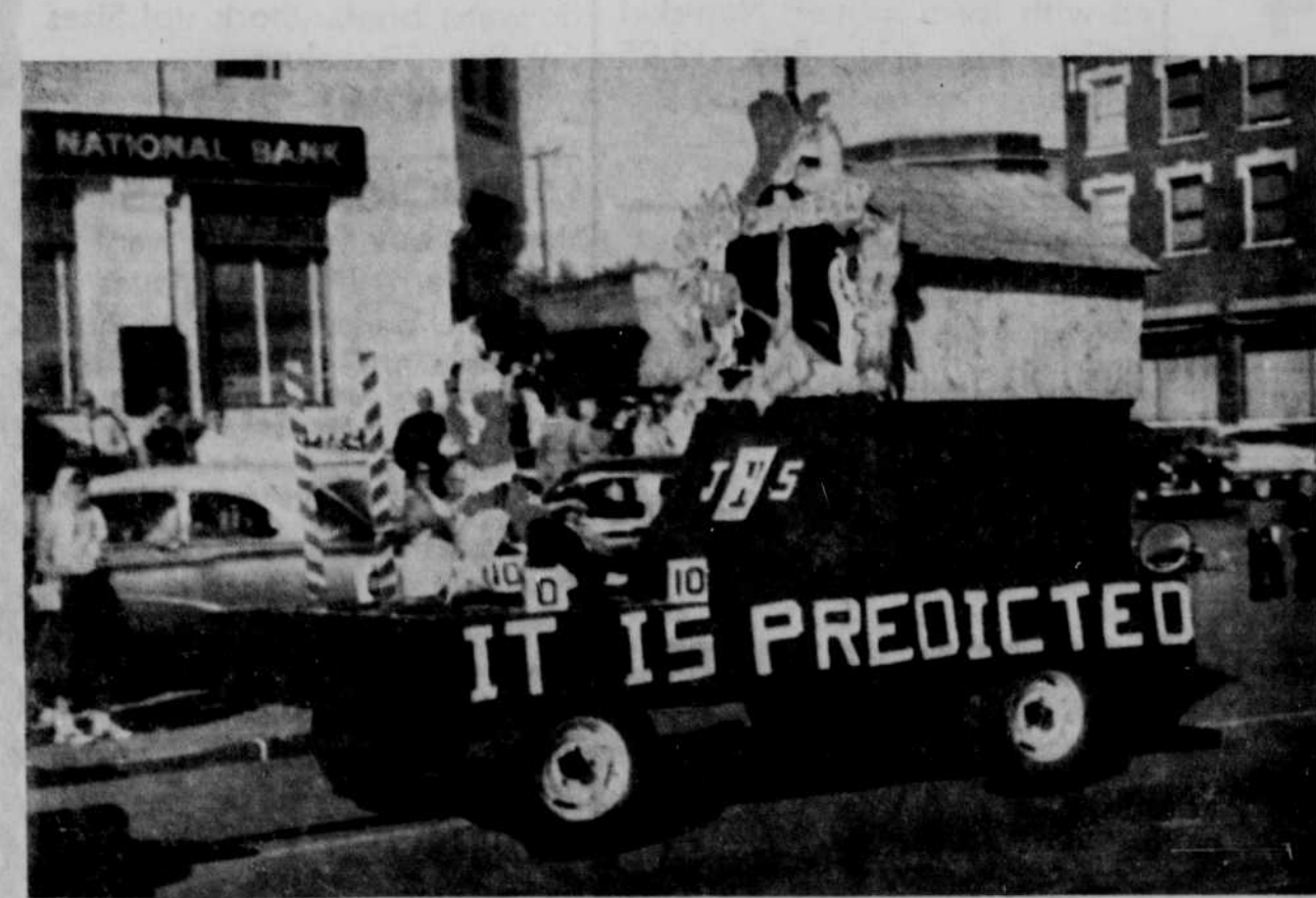
This float, entered by the junior high, was named as the third place winner.