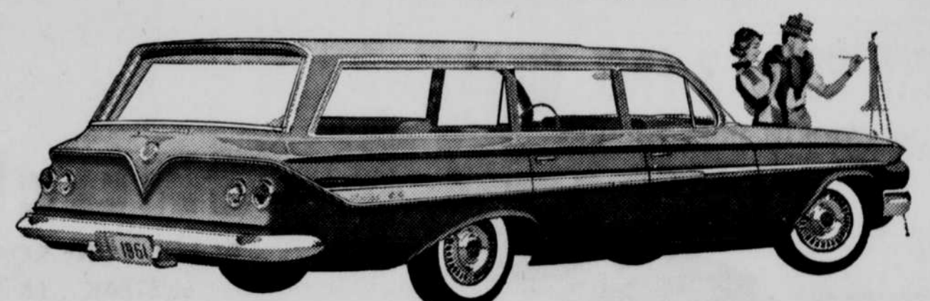
NOMAD 9-PASSENGER STATION WAGON. You have a choice of six Chevrolet wagons, each with a cave-sized cargo opening nearly 5 feet across.