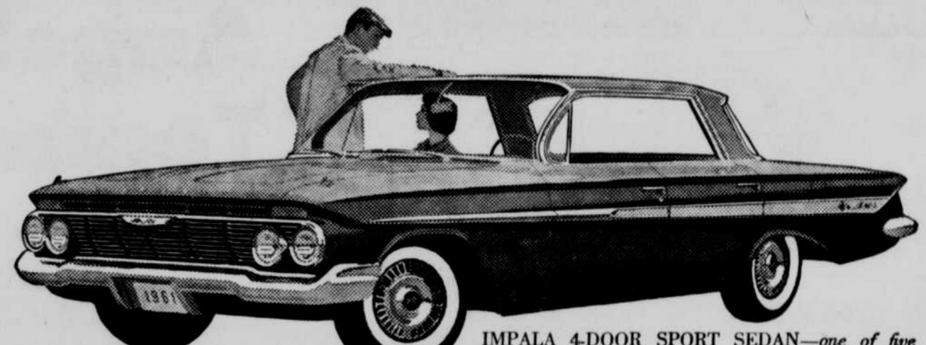
IMPALA 4-DOOR SPORT SEDAN—one of five Impalas that bring you a new measure of elegance from the most elegant Chevies of all.

Chevy's new '61 Biscaynes—6 or V8—give you a full measure of Chevrolet quality, roominess and proved performance—yet they're priced down with many cars that give you a lot less! Now you can have economy and comfort, too!