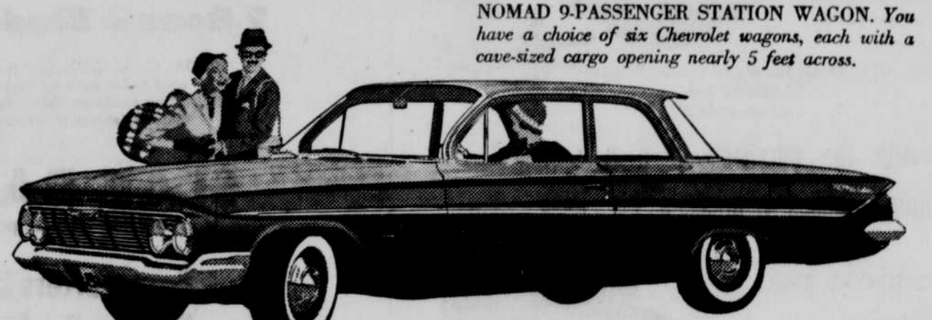
BEL AIR 2-DOOR SEDAN, like all '61 Chevrolets, brings you Body by Fisher newness—more front seat leg room.