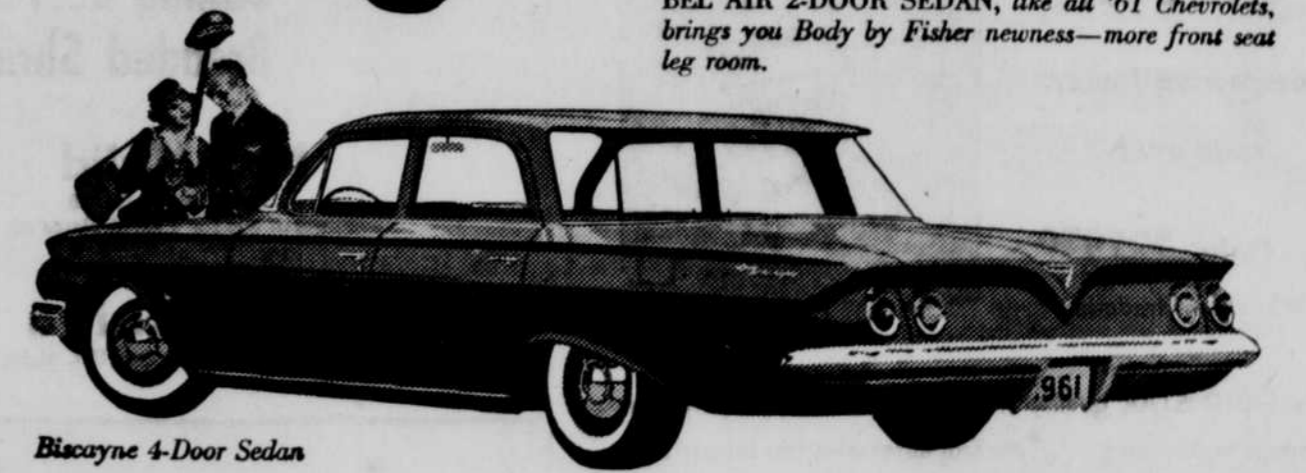
Biscayne 4-Door Sedan

See the new Chevrolet cars, Chevy Corvairs and the new Corvette at your local authorized Chevrolet dealer's