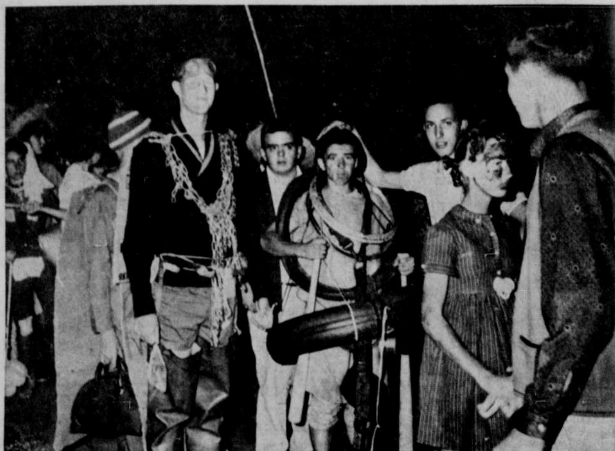
These members of the freshman class at O'Neill high school were not only all dressed up, they had somewhere to go. They were escorted through downtown O'Neill by members of the senior class Tuesday evening before the evening program which climaxed the initiation day.

The outstanding soldiers will be honored at an awards ceremony