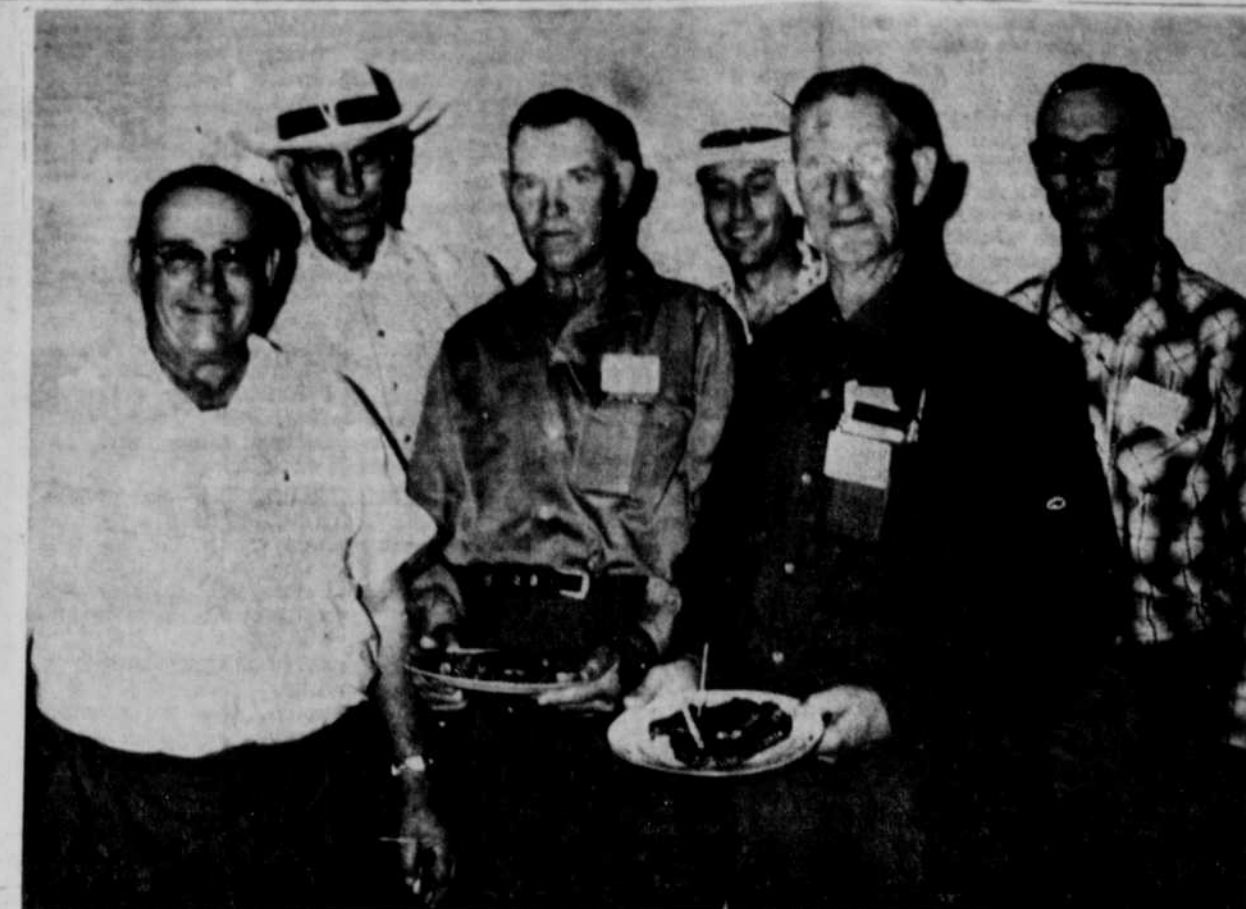
"The best reception we've received at any place during our tour." That was the general consensus of the touring group of Phelps county cattle feeders as they met at the O'Neill country club for a steak supper courtesy of the O'Neill Chamber of Commerce. The feeders had earlier visited ranches in Holt county. Some 40 feeders were guests at the supper and later met with members of the chamber to discuss irrigation. Phelps county is included in the Tri-County Irrigation projects and problems similar to those encountered in the O'Neill project were discussed.