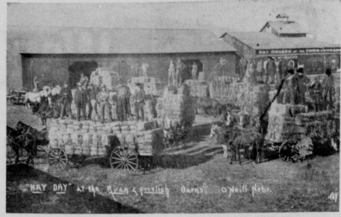
A scene from O'Neill's early history. Does anyone know the date?