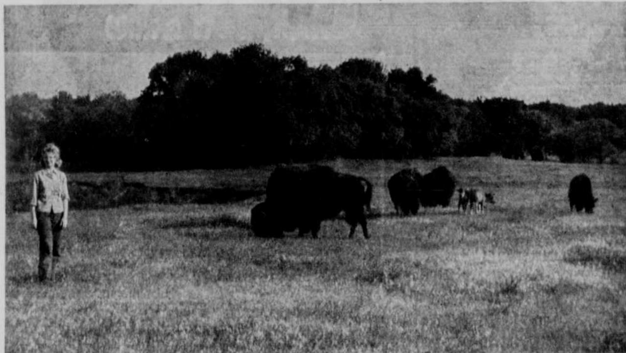
The days of buffalo hunts and rounding up long-horn cattle may be gone but a few species of each still remain in the Beef Empire. Fred Uhlir, who ranches northwest of Orchard, has both long-horn steers and a herd of buffalo on his 31 hundred acre ranch. The long-horns were purchased at Valentine and are as docile as any farm raised cattle. The buffalo also are tame but prefer to be left alone. Visitors to the ranch can approach the animals to within a few hundred feet in a car but they simply turn and walk away when approached on foot. The herd now consists of six old buffalo and two calves. The Uhlirs regard the animals as pets and the buffalo in turn seem content to live out their lives on the ranch where grass and water are plentiful and interruptions in their daily life are not too numerous.