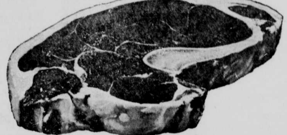
U. S. D. A. Choice Grade Beef, Aged

At Safeway's meat-aging plant, fine meat is scientifically aged under constant temperature and humidity controls until it reaches perfect-eating goodness. Specially designed equipment and giant aging rooms guide the meats in their natural aging. This scientifically controlled aging is a key step in assuring our stores of the most flavorful, tender meats you can buy, day after day.