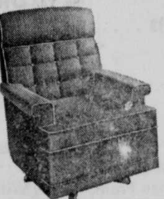
Swivel Rockers Foam Rubber Cushion 3 colors