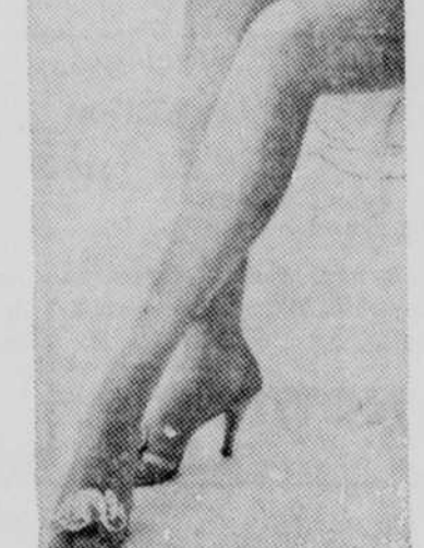
SPECIAL GAYMODE HOSE

First quality 60 guage, 15 denier dress sheers in a choice of self-color or dramatic dark seams. Gala (medium beige) and con-