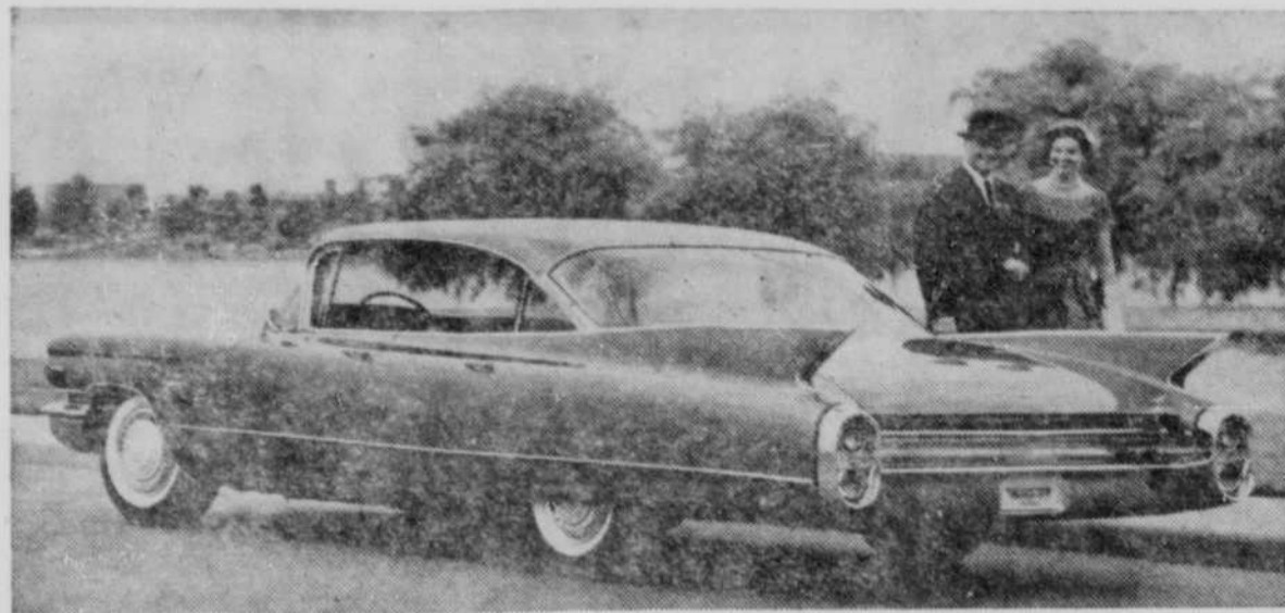
The sweeping elegance of the newly created silhouette of the Series Sixty-Two six-window Sedan typifies the handsome lines and simplicity of design of the 1960 Cadillac. The popular six-window Sedan features all of the advanced engineering and design characteristics of the new models.