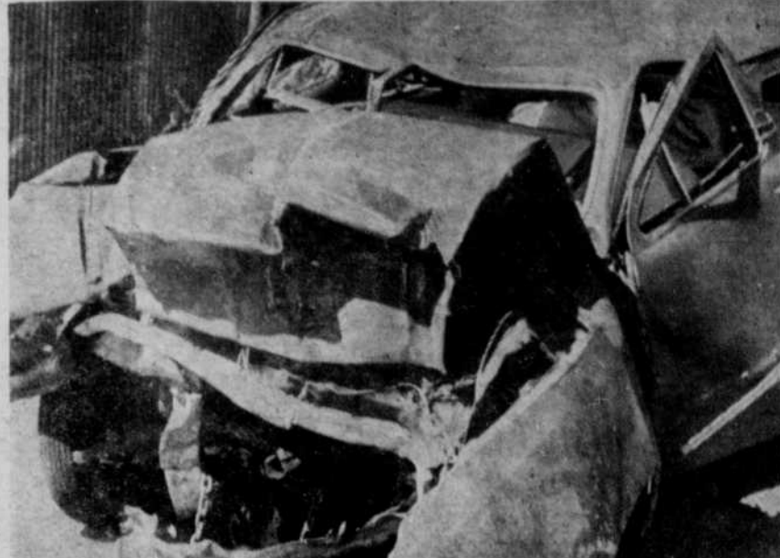
Schneider death car ...