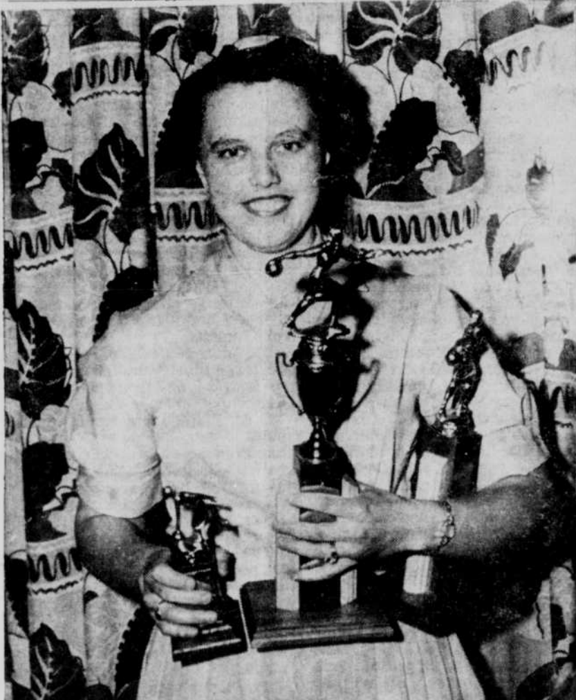
year for her bowling prowess. She won the O'Neill women's championship, the O'Neill women's city tournament and the doubles high.