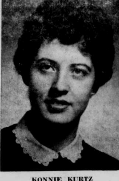
. . . valedictorian