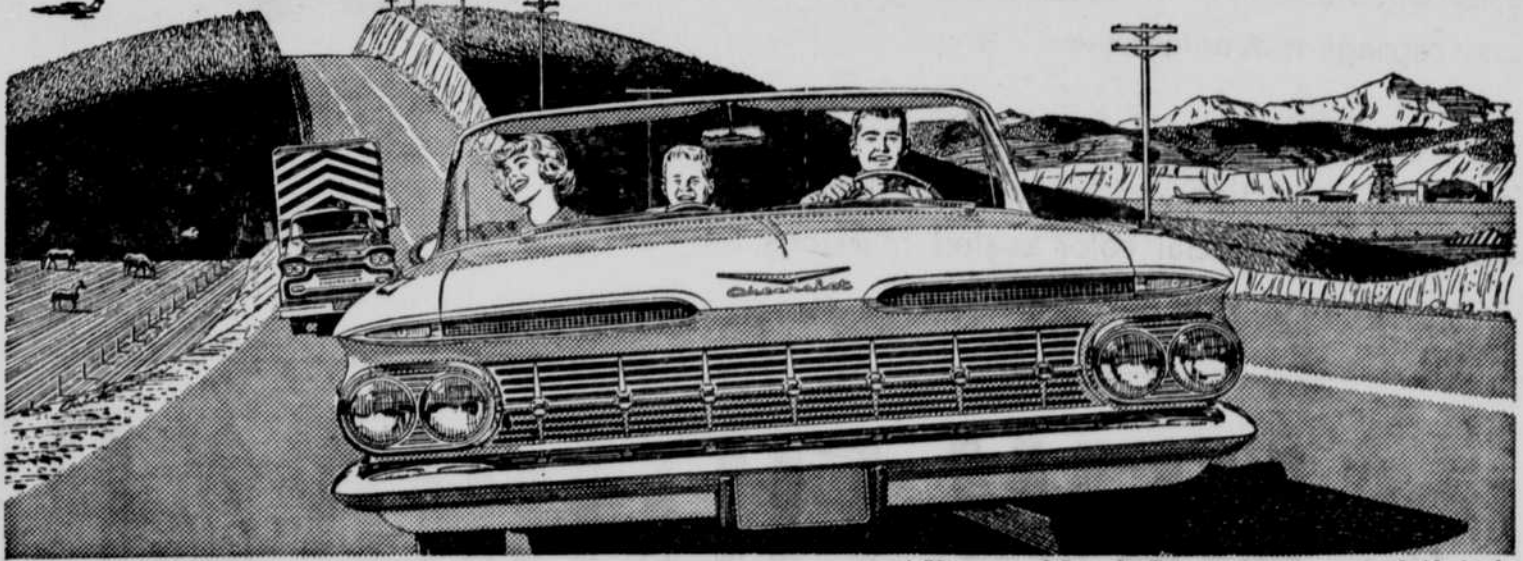
A V8-powered Impala Convertible... unmistakably '59!