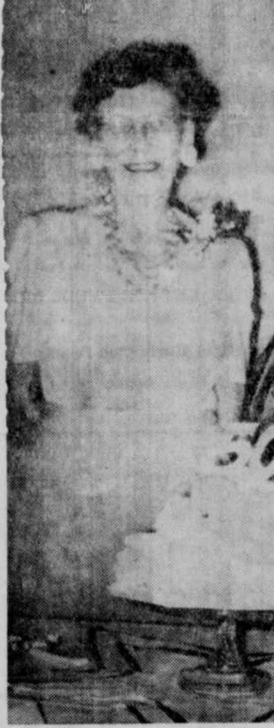
Receive 50-Year Pins