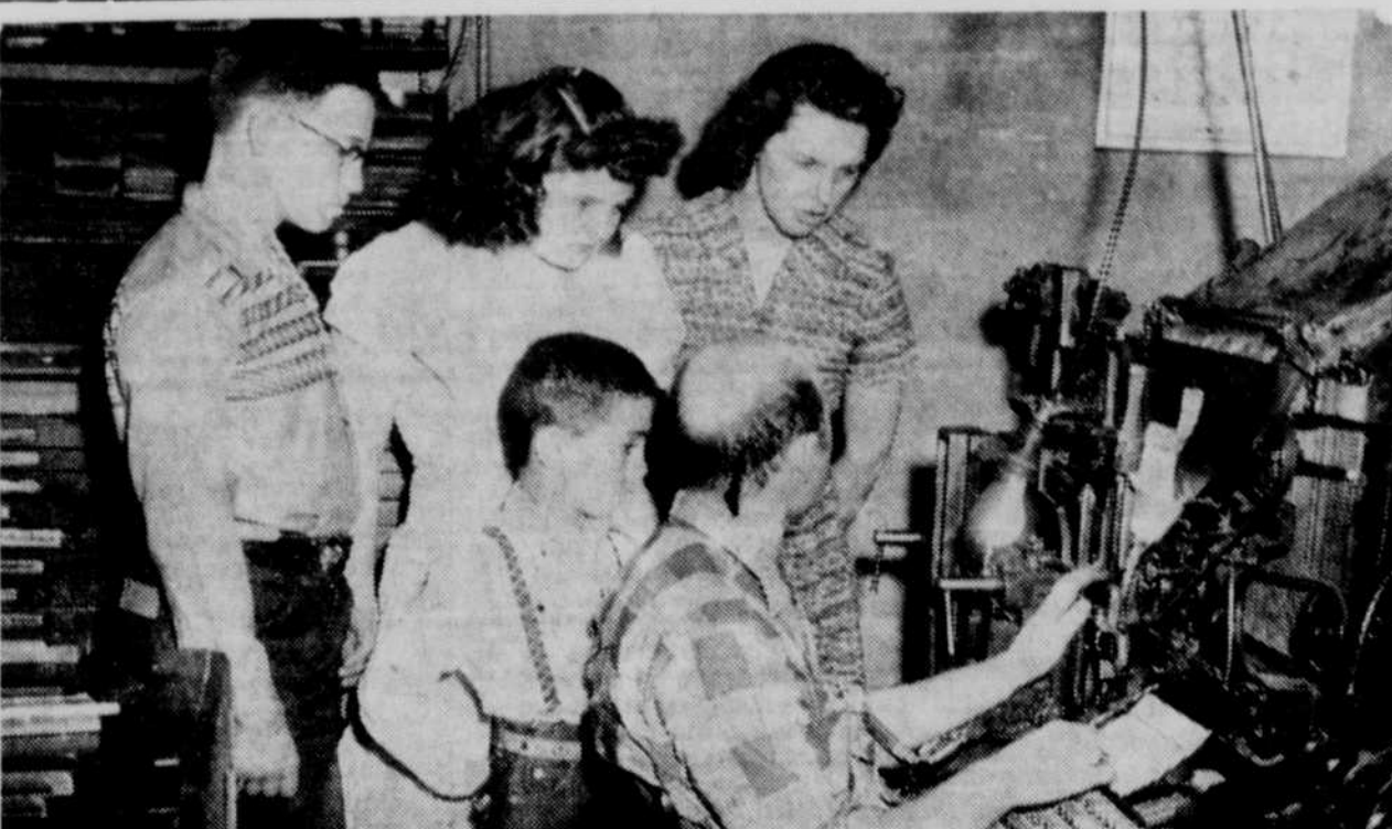
Tour The Frontier