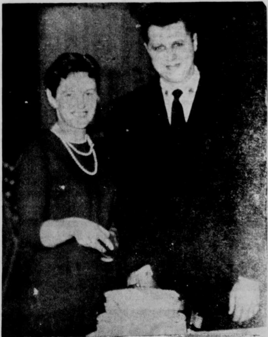
Legion Birthday Cake