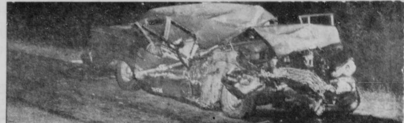
The Haakinson Death Car