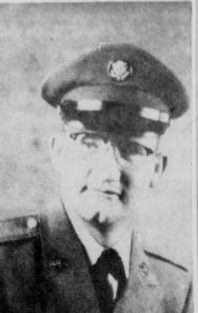
reaches 90th milestone