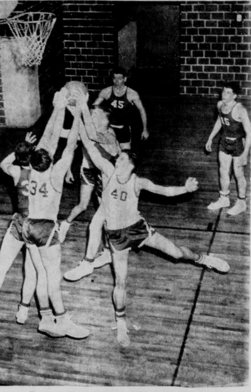
Here's action in Tuesday night's cage game in which the O'Neill Eagles pressed Albion until the waning moments.