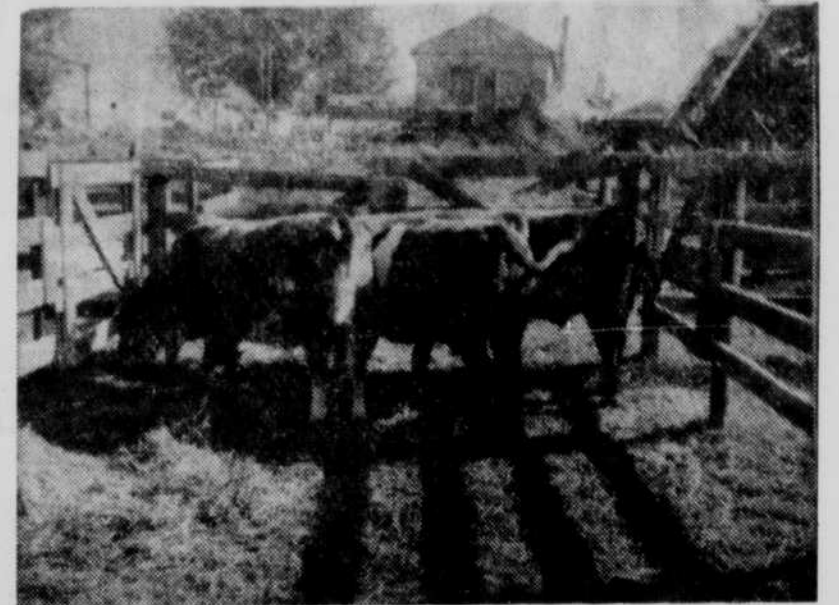
These are Shorthorn calves that were purchased a year ago from the Emmet Hay company . . . they won top laurels in Iowa. (Story on page 7.)