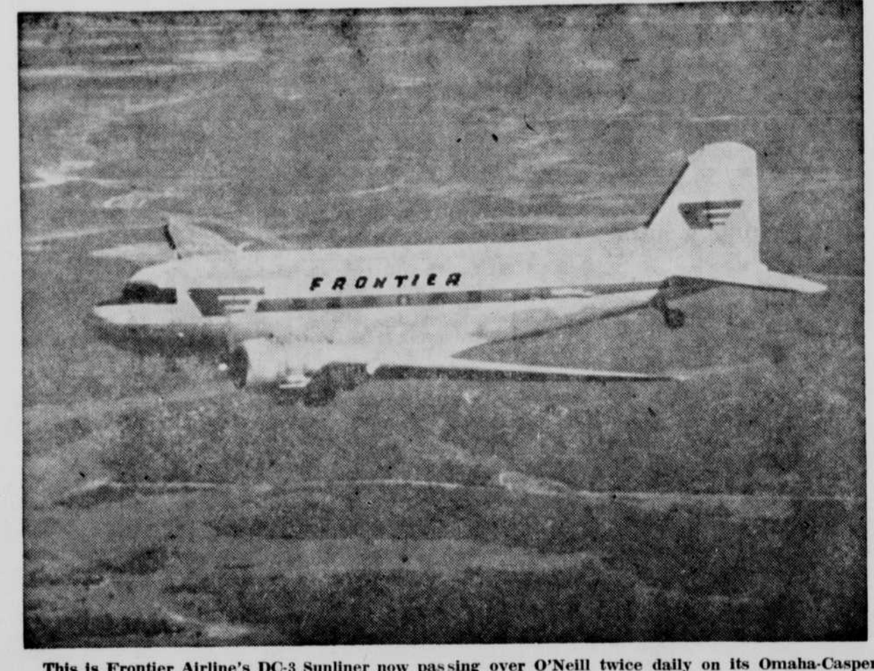
This is Frontier Airline's DC-3 Sunliner now passing over O'Neil twice daily on its Omaha-Casper-Omaha routes. Northern Nebraska's first scheduled commercial air service began Wednesday.