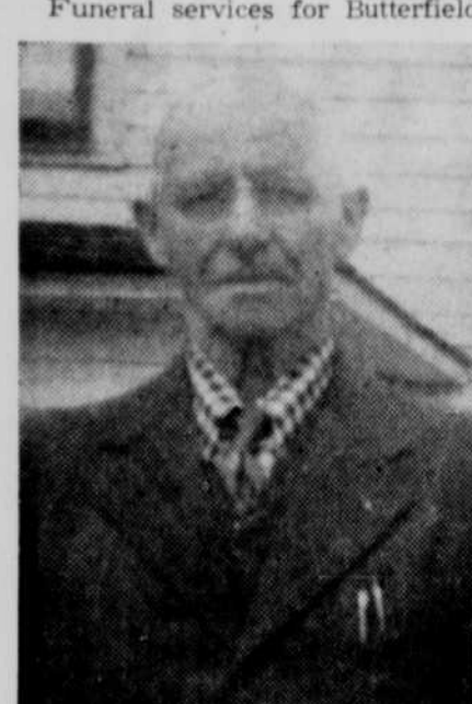
Butterfield . . . succumbs.

sweetclover. Funeral services for Butterfield