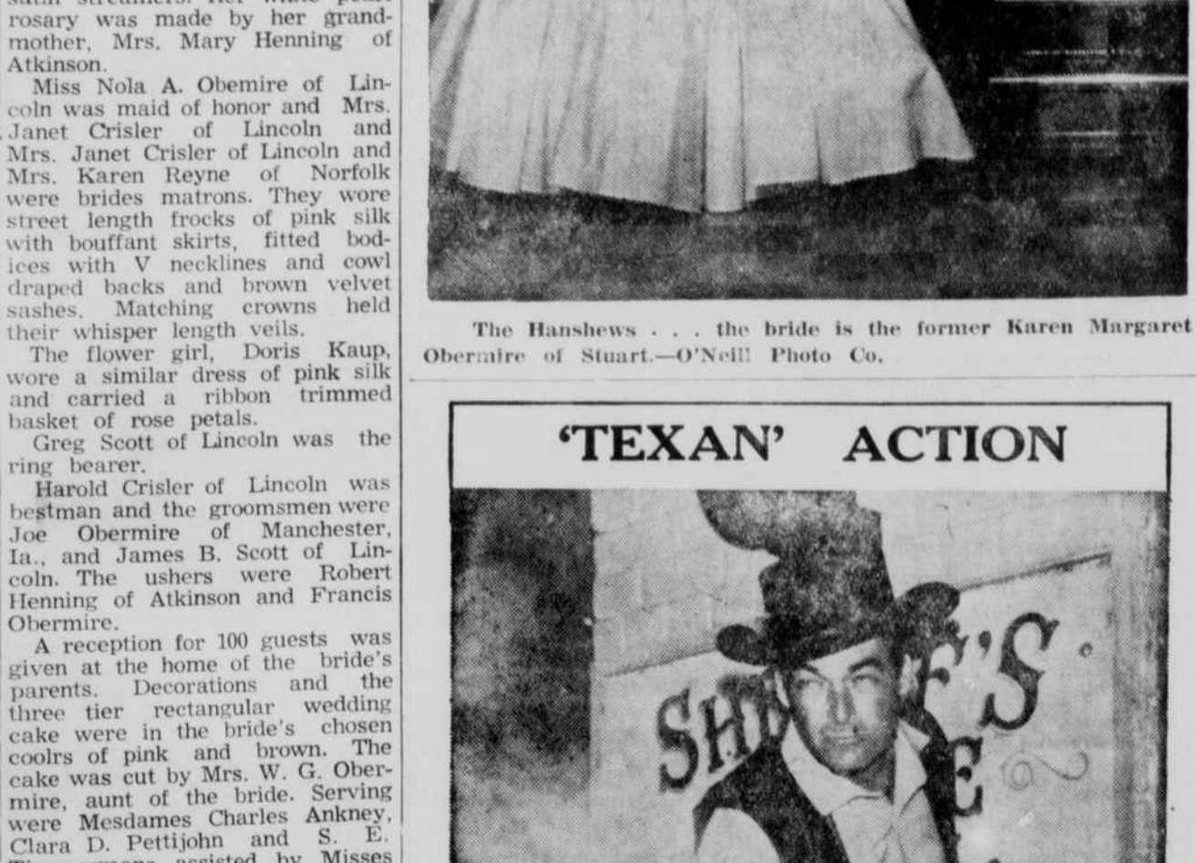
AS 'THE TEXAN,' Rory Calhoun is not a man to blaze away indiscriminately. Here he has a double-barrelled purpose. One is to announce the premiere of his new television series starting on CBS-TV September 6, and continuing each Saturday at 8:30 p.m., EDST. The other is to show a scene from "The Texan," and a typical pose of Bill Longley, the character he portrays, who was the most respected figure in post-Civil War Southwest. This marks Calhoun's first regular series on television after completing more than 60 fulllength movies.