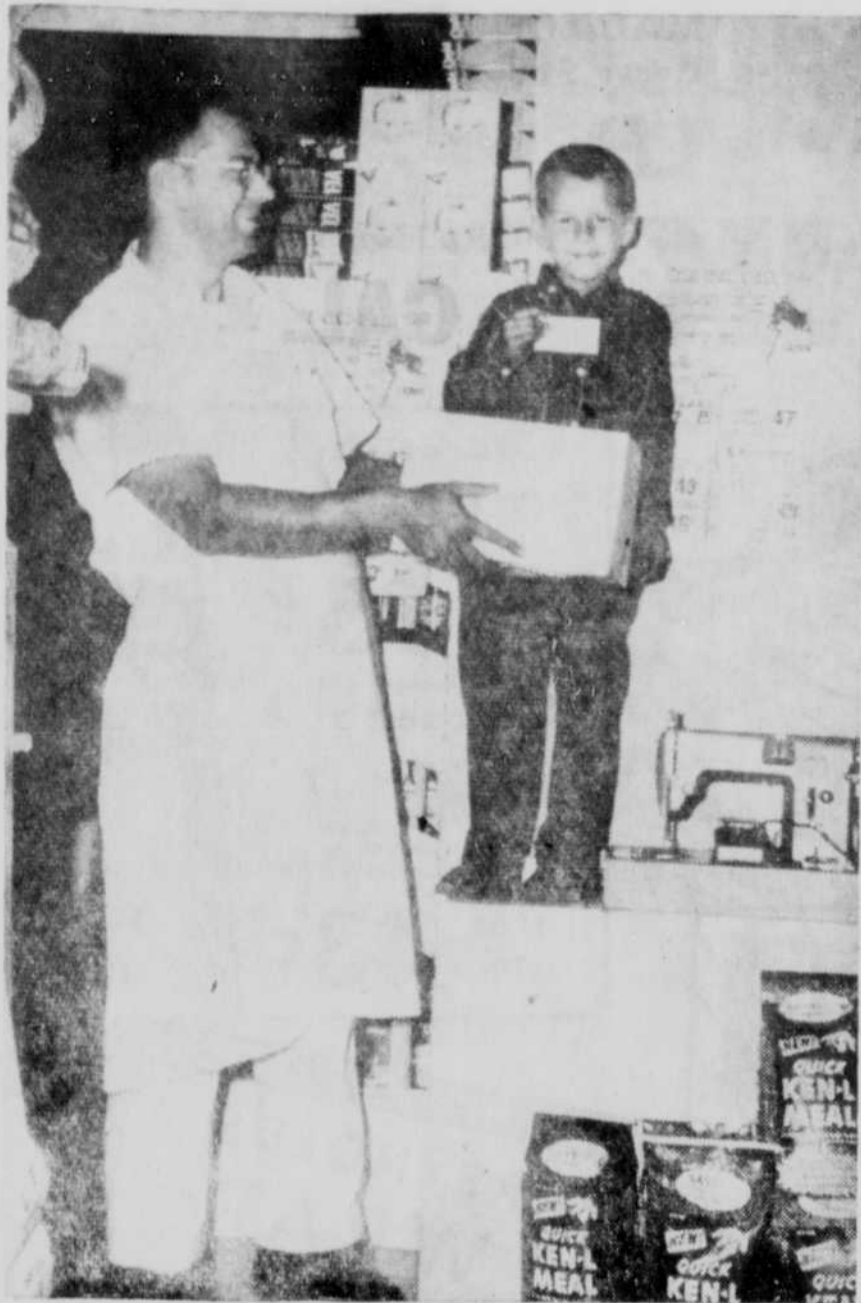
Sewing Machine Winner Named