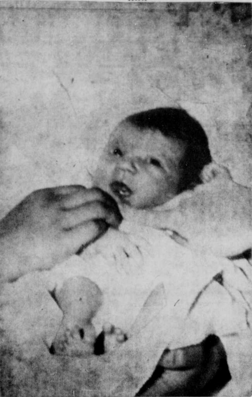
'Hello, World! I've Got a Tooth!'