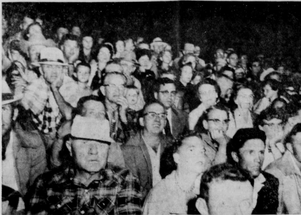
These wide-eyed spectators followed the action Thursday night during the bronc riding portion of the rodeo program at the Holt county fair. It was a record attendance at the rodeo performance the first night.