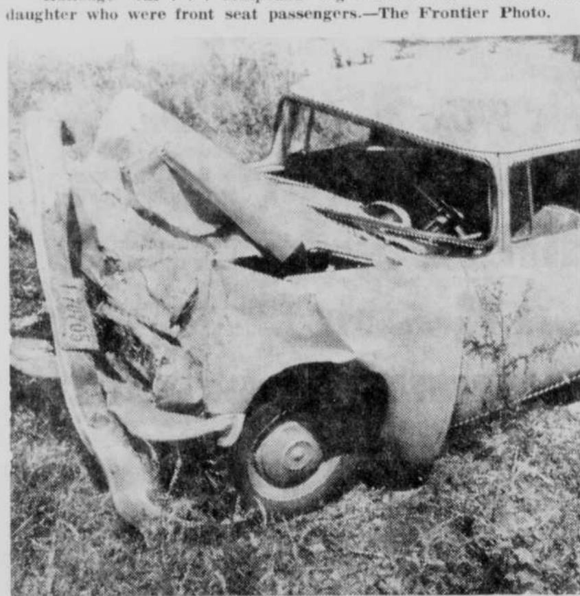
escaped with fractured ribs, lacerations.