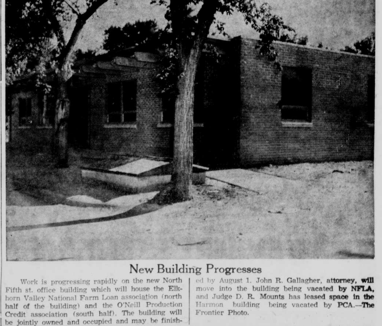
New Building Progresses Work is progressing rapidly on the new North Fifth st. office building which will house the Elkhorn Valley National Farm Loan Association (north half of the building) and the O'Neill Production Credit association (south half). The building will be jointly owned and occupied and may be finished by August 1.