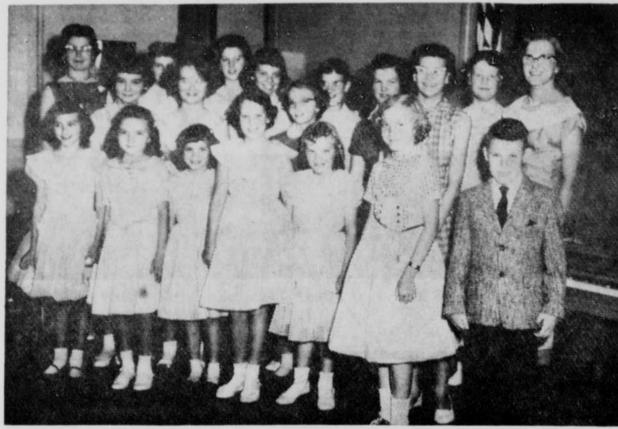
Piano Pupils Heard in Recital