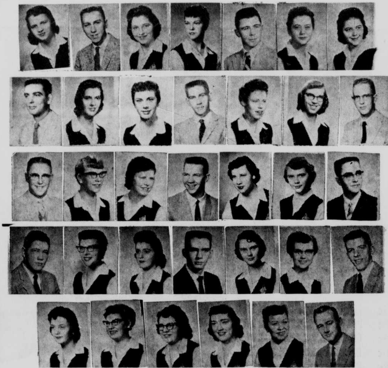
St. Mary's Seniors — Class of 1958