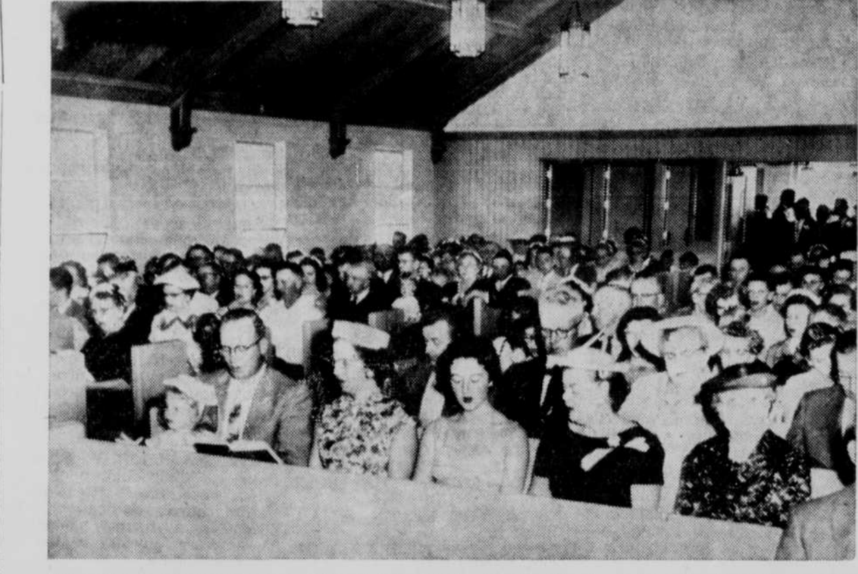
This interior view shows a portion of the crowd attending Sunday's 10 a.m., dedication service at Christ Lutheran church.-The Frontier Photo.

This photo of the new 76-thousand-dollar Christ Lutheran church was taken Sunday morning moments before the doors were formally opened for the first time. The main part of the church and the basement overflowed with parishoners, former members of the parish, visitors and other wellwishers .- The Frontier Proto.