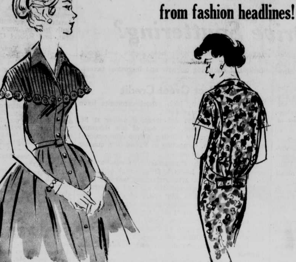
Captivating Coat Dress With tucks 'n trim

Arnel, cotton blend in powder blue, pink, green, white. Lace rosette trim.