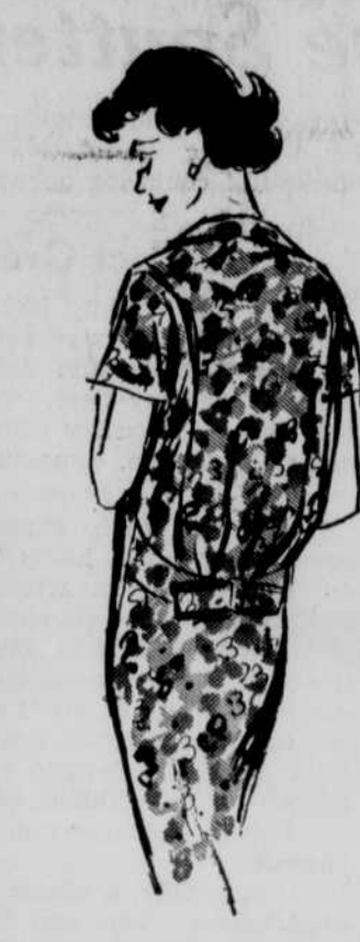
A little daring. A little darling!

Arnel, cotton blend in powder blue, pink, green, white. Lace rosette trim.