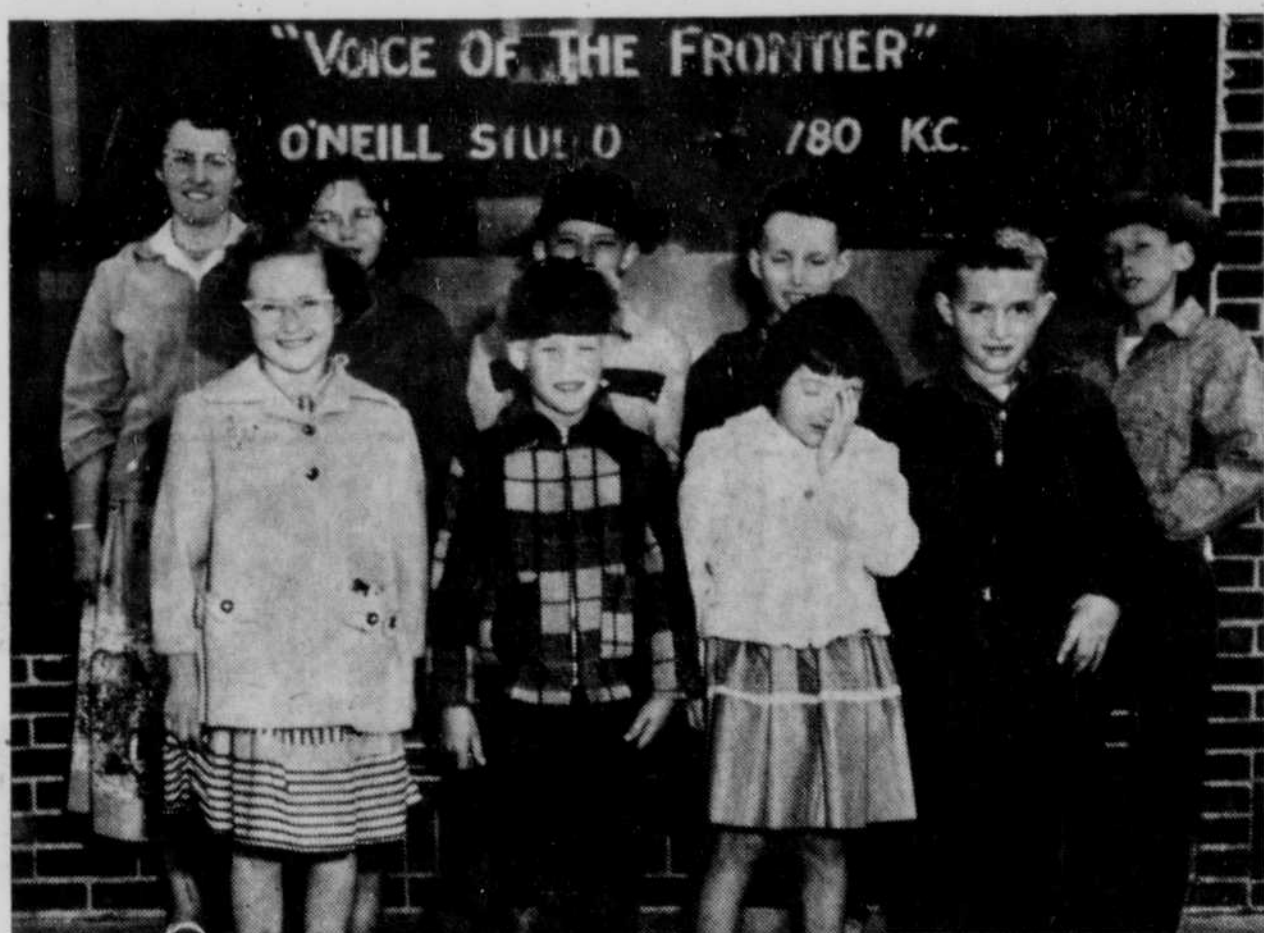
District 49 Pupils Have Look-See