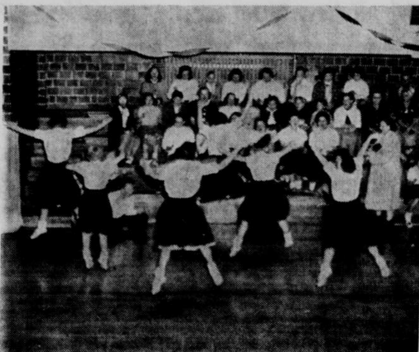
These are St. Mary's academy cheerleaders in action during the recent Holt county grade school tournament.