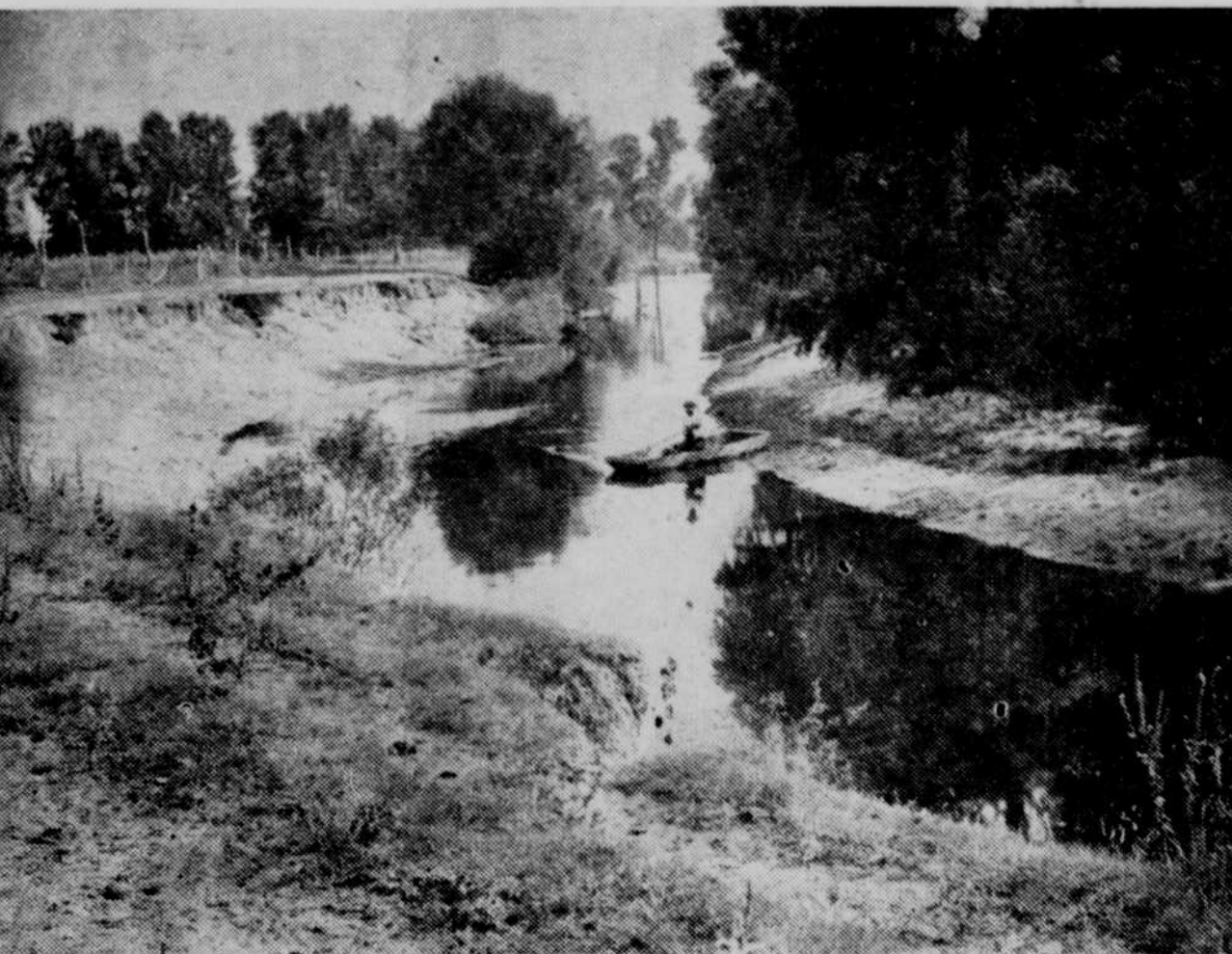
The silvery Elkhorn half-century or more ago. Where and when was picture taken?