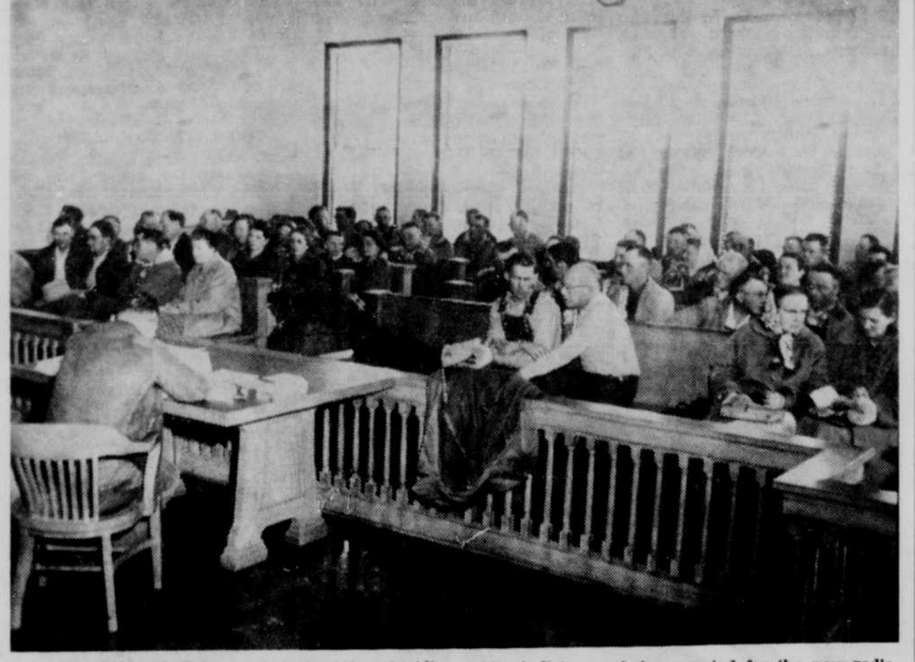
Members of Holt county school boards idle while ballots are being counted for the new redistricting committee.