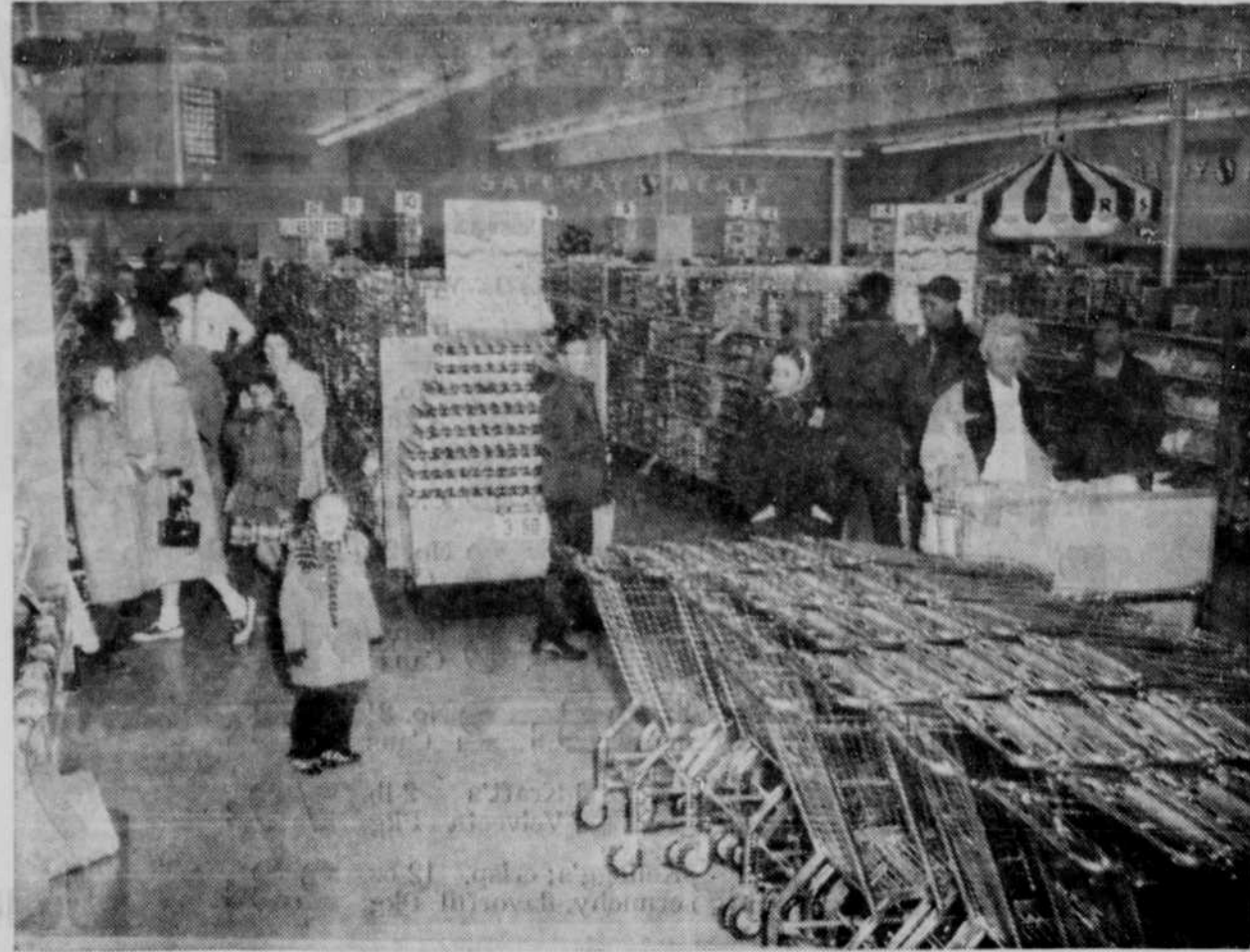
Interior view of O'Neill new Safeway store during Monday evening's preview. Attendance at the preview far exceeded the company's expectations.