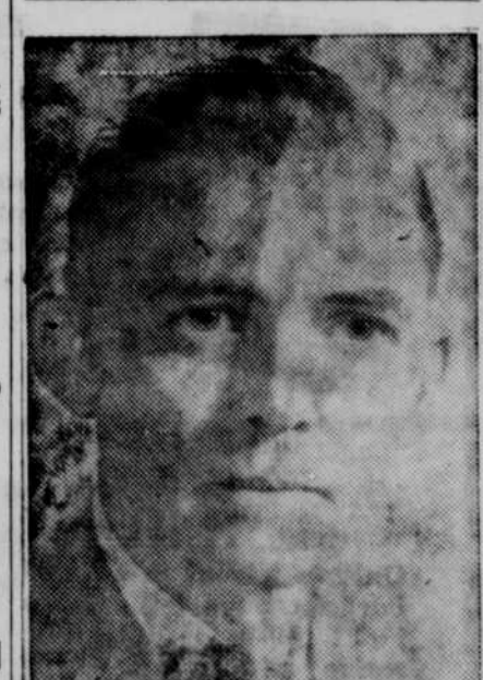
To Preach Here

band Wedesday went by auto ted States from Baden, Germany ed Wednesday from a six days' at the age of 17. His mother came of the United States from Baden, Germany ed Wednesday from a six days' at the age of 17. His mother came of the United States from Baden, Germany ed Wednesday from a six days' at the age of 17. His mother came encert by the air force band.