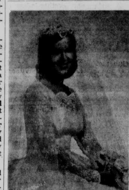
Weds at Hastings