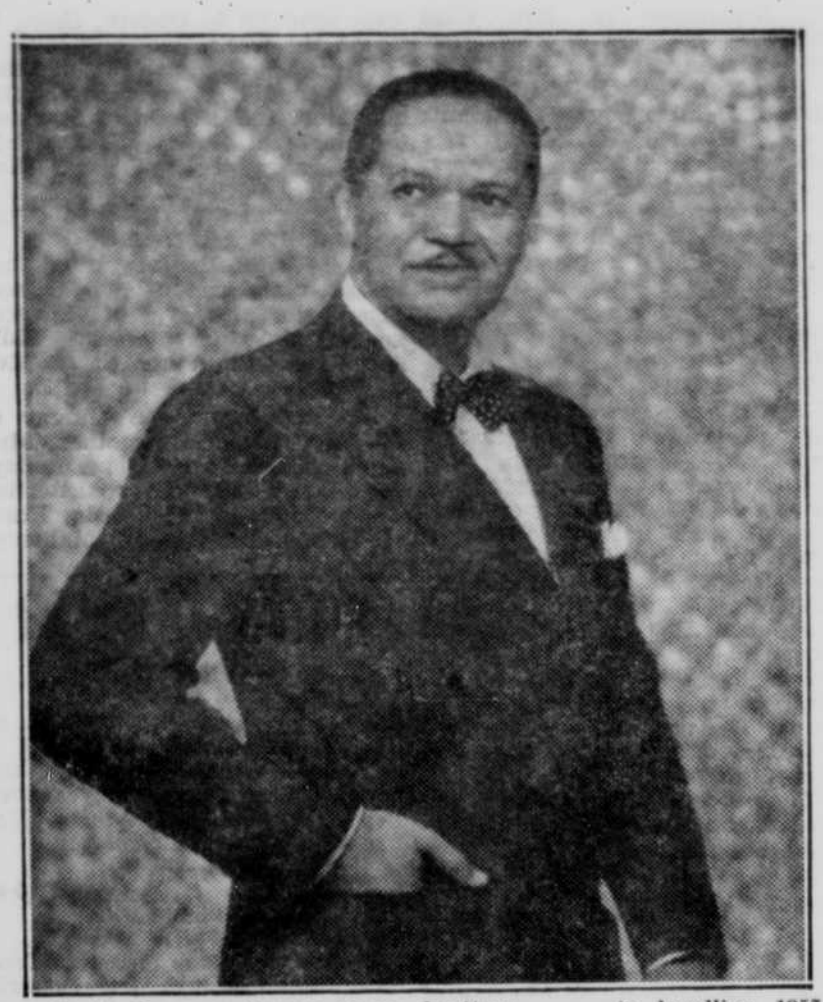
Todd Duncan, famed Negro baritone . . . to headline 1957-