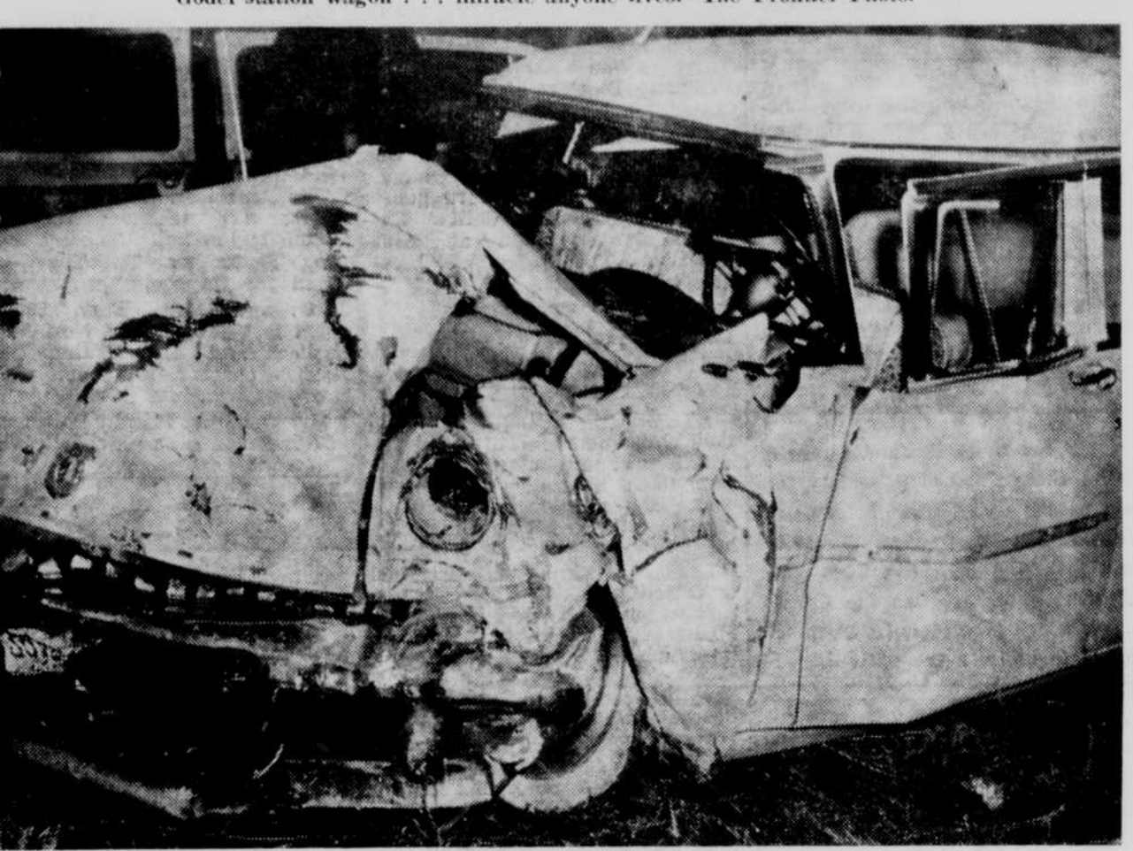
Fahrenholz car . . . similarly damaged.