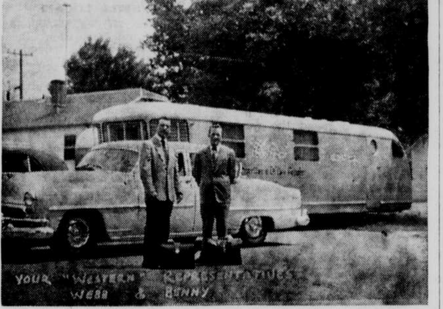
This is the Western Typewriter & Supply company's display car which will visit O'Neill Thursday, September 12, 9 a.m., until 9 p.m. Latest type office machines will be displayed.