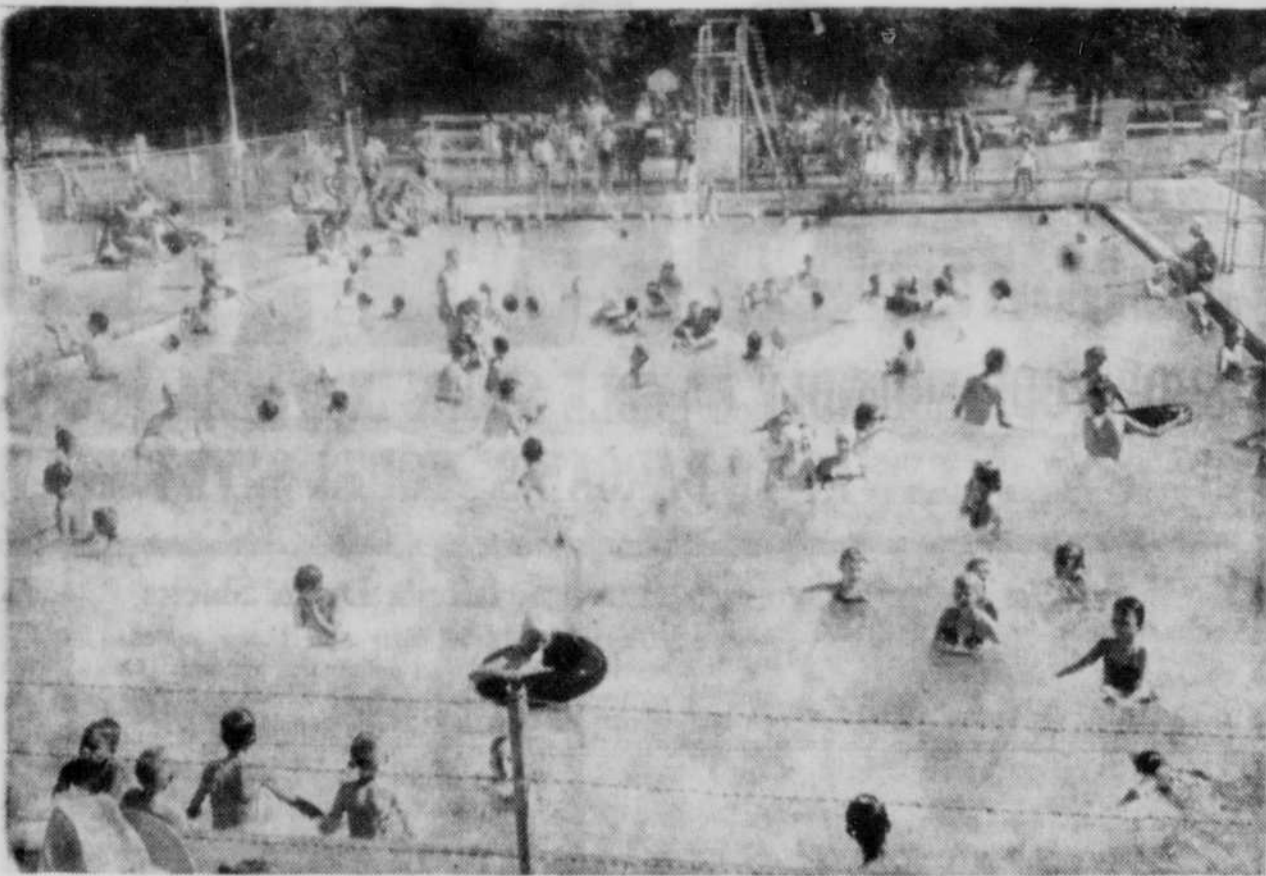
Pool Filled while Mercury at Century Mark