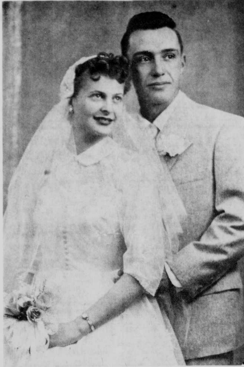
Couple Weds at Chadron