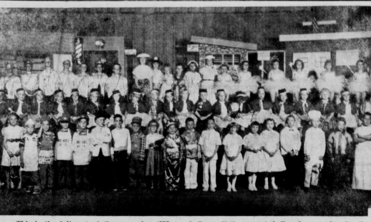
This is the full cast of the song-play "When I Grow Up", presented Tuesday evening by the O'Neill public school kindergarten. (Additional pictures and details on page 3).

Houck said the problems of marketing beef are such that cattlemen must conduct a vigorous campaign to get their share of the market.