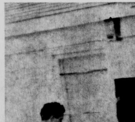
O'Neill firemen were summoned at 1:30 p. m., Sunday to the Gateway motel where a gas heater caused an electrical short and a fire resulted.