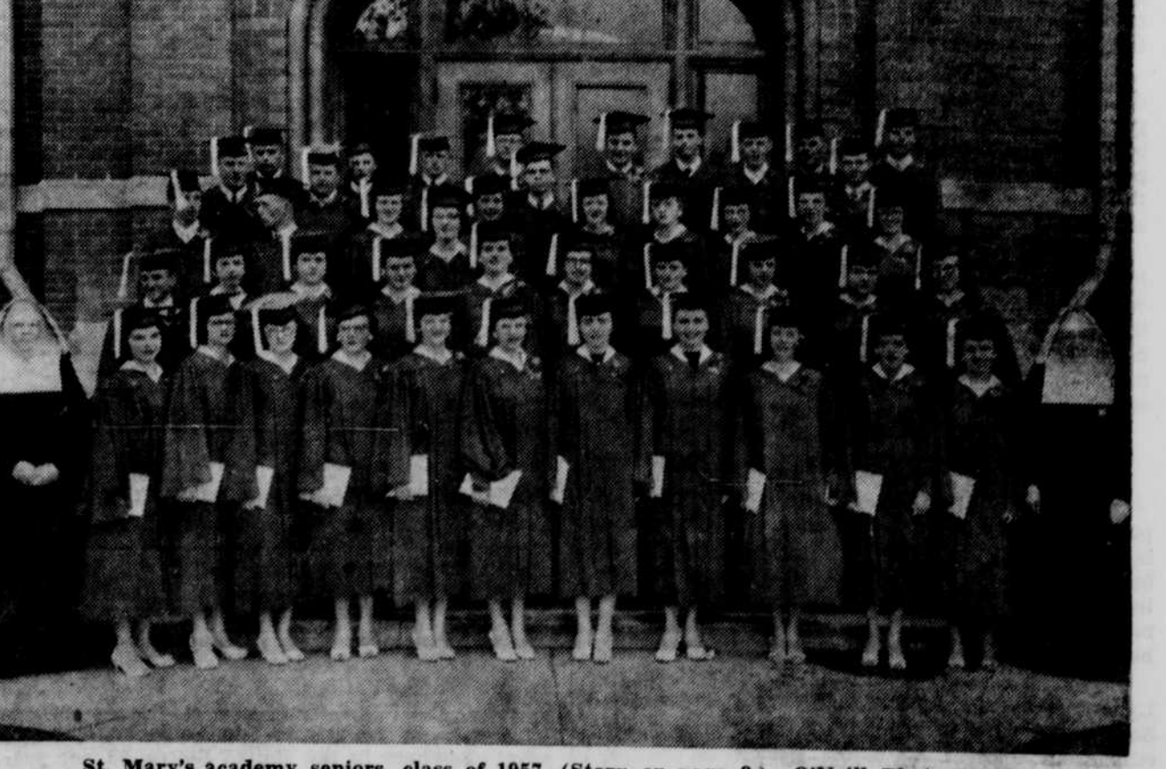
St. Mary's academy seniors, class of 1957. (Story on page 8).

"If for any reason you will not be at home, please leave the following information on your front door knob: Name of parents, names of all children up to 21-years-old, dates of birth of the children, giving month, day and year."