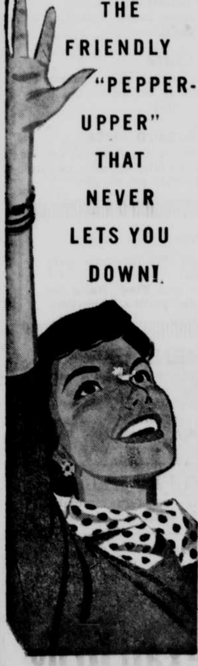
Meri Dr Pepper Bottling Co.

THE FRONTIER. O'Neill, Nebr., Thurs., May 16, 1957.—PAGE 3.