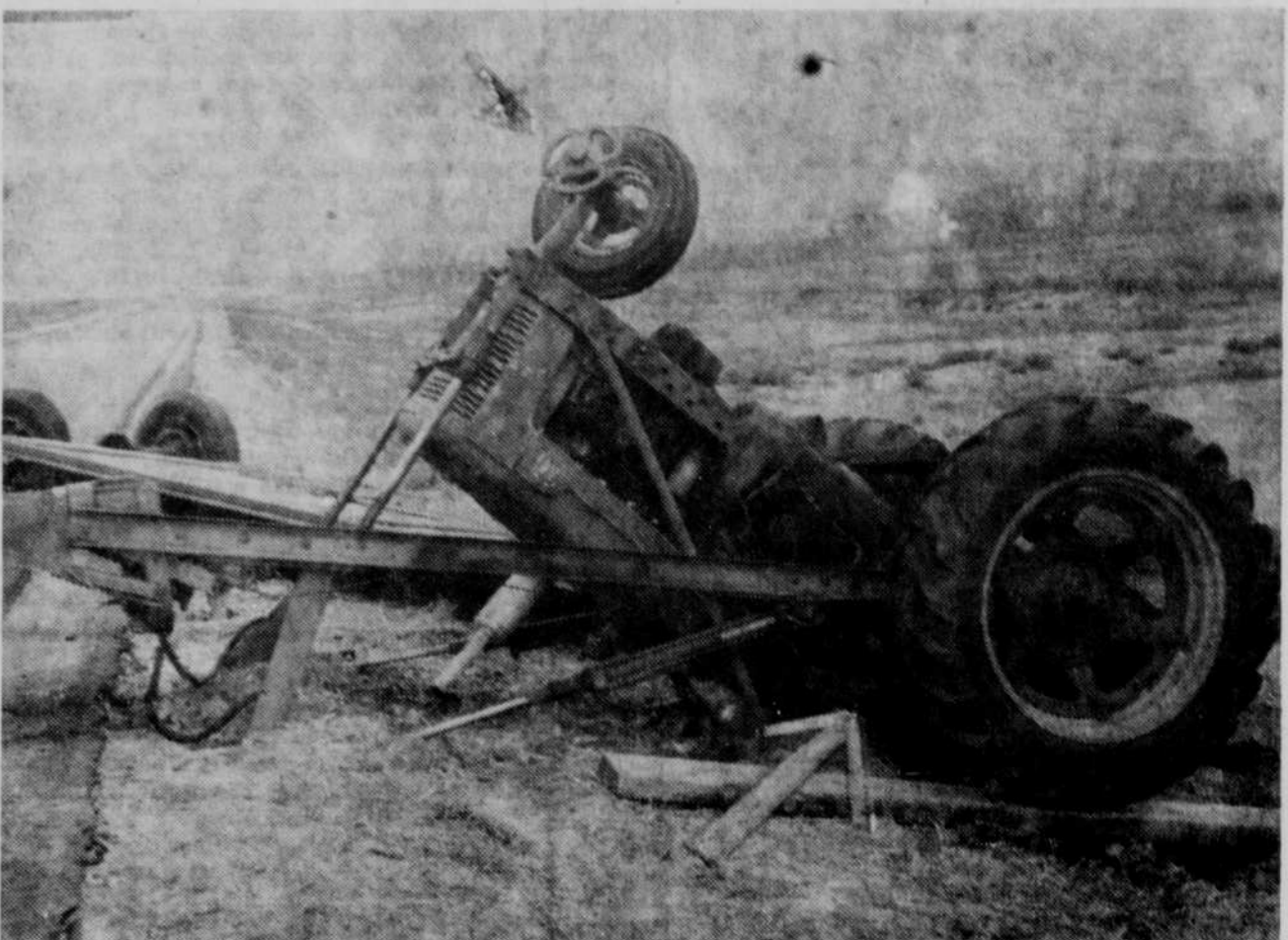
Howard McConnell, driver of this tractor, was fatally injured Wednesday afternoon when one of the front dual wheels (black arrowed) snapped off and caused the tractor to go out of control, upsetting on the driver and crushing him to death. Body was extricated from under partially seen rear wheel (white arrow). Camera faces north on U. S. highway 281 at point 13 1/2 miles south of here.