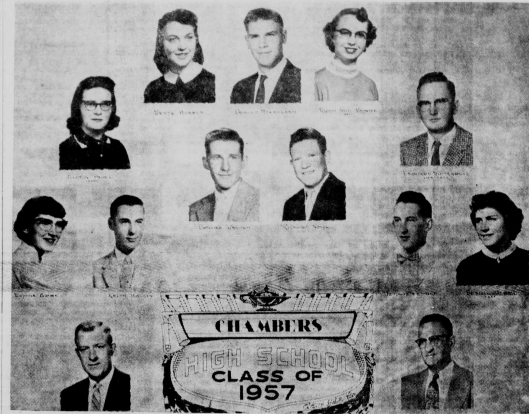
CHAMBERS HIGH SCHOOL CLASS OF 1957